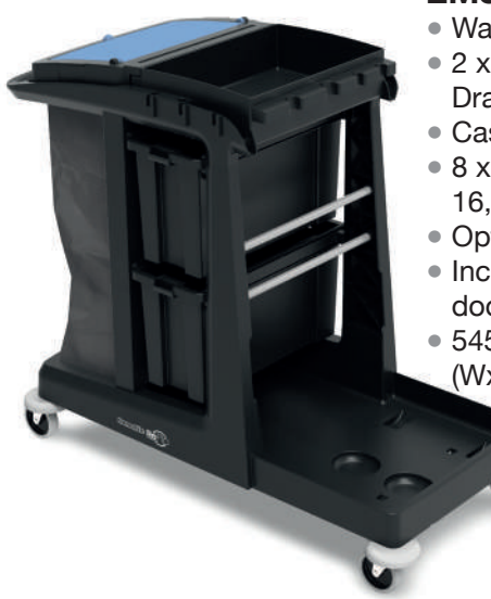
EM5 / EM6 Maximum storage