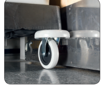
Buffer Kit Non-marking rotating buffers for extra wall and door protection.