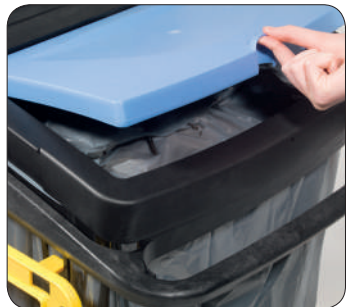
On-board Waste Facility Convenient, fully-lidded 120L waste facility; right there when you need it.

Attention to detail and practical engineering ensure complete customer satisfaction in operation, versatility and convenience.