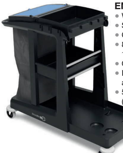
EM3 / EM4 Mid-size versatility