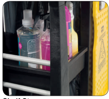
Shelf Storage Open shelf storage for easy-access to all your cleaning equipment and supplies on the move.