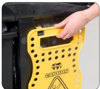
Optional Floor Sign Compact and easy to store design.