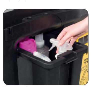
Drawer Storage Enclosed drawer storage to keep supplies tidy and out of sight.