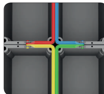
Industry Colour-coding Industry colour-coding for effective infection control.